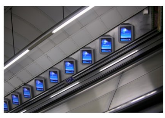
Award winning 23" E5C Digital Escalator panels. Installed on London Underground Network's escalators.